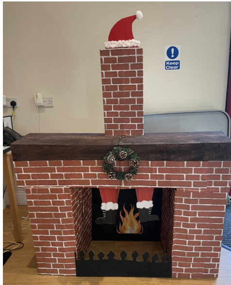
When Santa got stuck in the chimney... Our home-made and decorated Christmas fireplace, yet to be completed with stockings and tinsel

By the end of November, we were all in full Christmas mode. We have been crafting and decorating till our hearts content, getting very creative (if we do say so ourselves) and having lots of fun while we did so